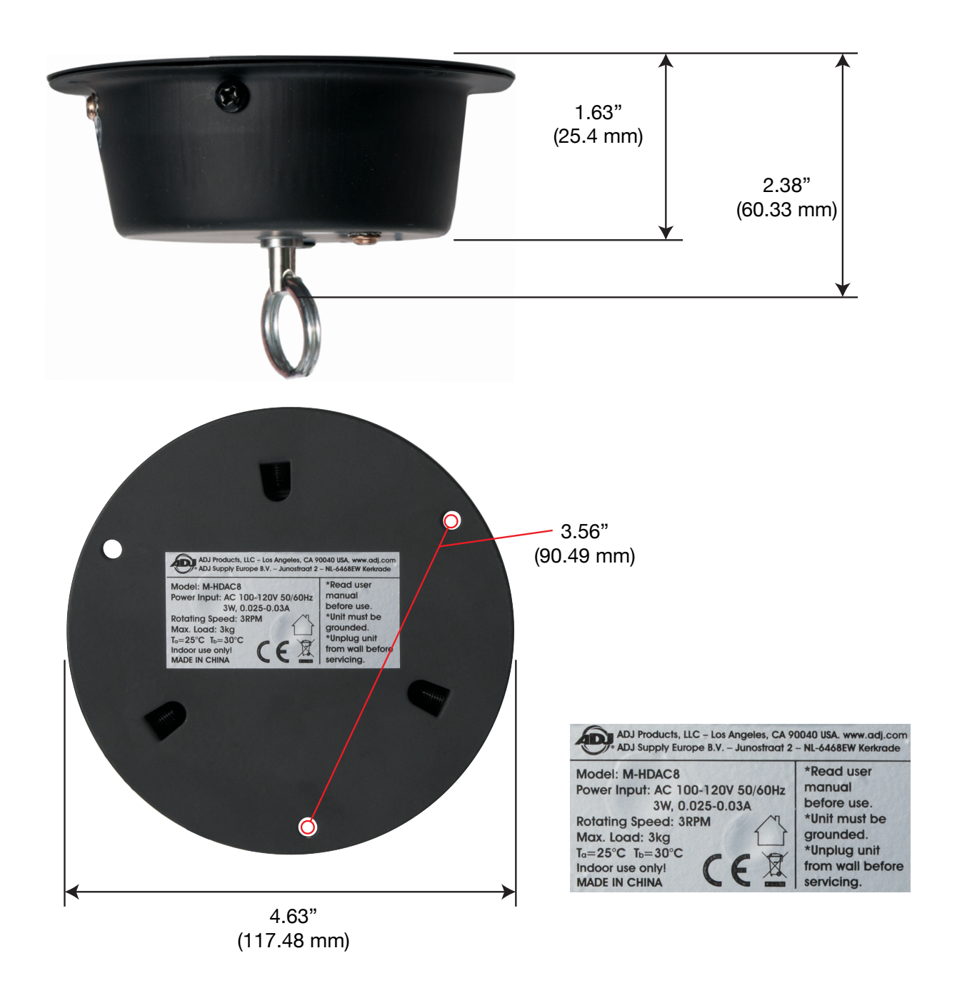
Specifications subject to change without any prior written notice.