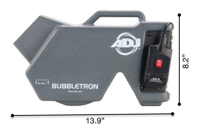
Please Note: Specifications and improvements in the design of this unit and this manual are subject to change without any prior written notice.