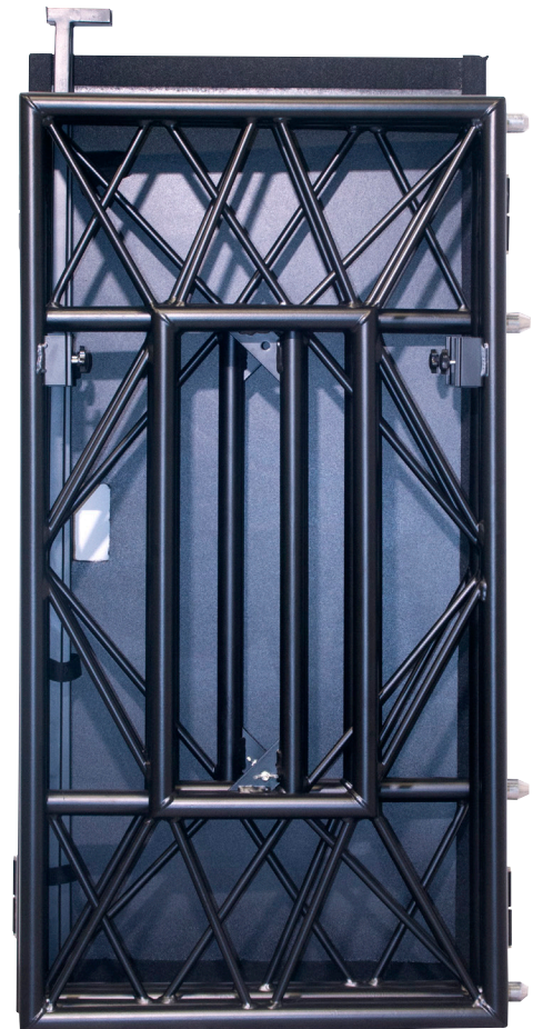
Collapses in half for compact transport