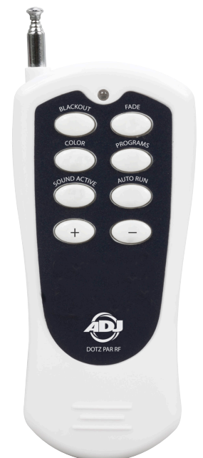
DOTZ PAR RF wireless remote control (sold separately)