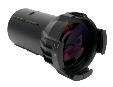
19°, 26°, 36°, 50° LENS Options (sold separately)